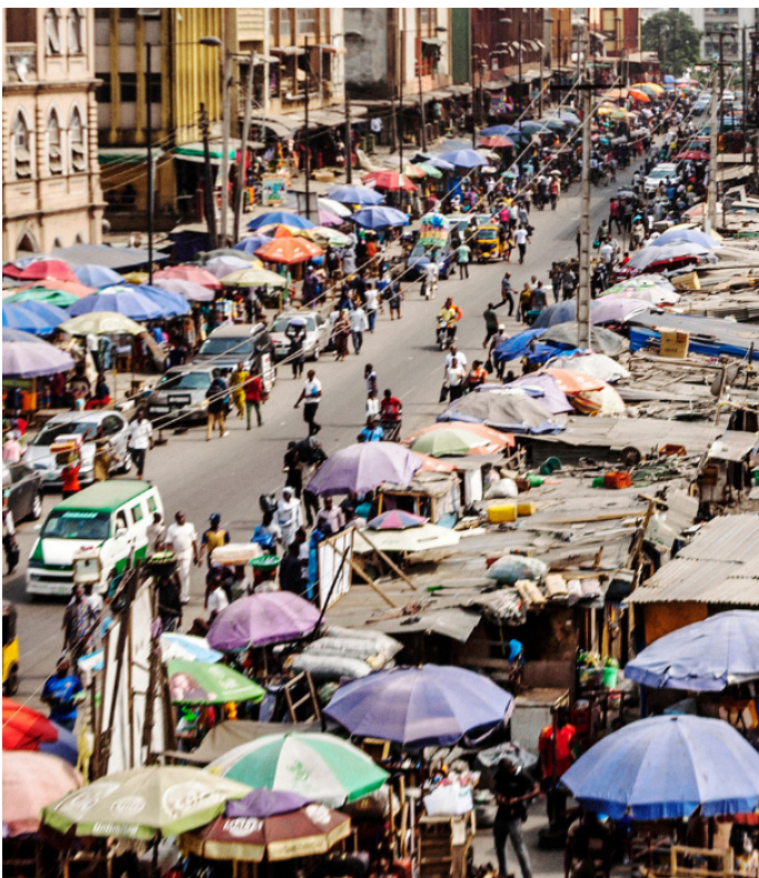
Photo: Lagos, Nigeria.

Like every field of human endeavor, WFBMs are equally encumbered by several challenges and risks. One significant obstacle is the patriarchal structures within society, where discrimination based on traditional norms, gender stereotypes and religious and cultural practices hinders the participation of women in community activities and leadership roles. Religious leadership also poses a significant challenge, leading to discrimination within male-dominated religious leadership structures, especially as the acceptability of women in religious leadership structures is limited.