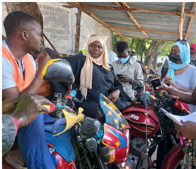
Maskani visit by the Mombasa Women of Faith Network in Mombasa, Kenya, to advocate for peaceful co-existence in October, 2022.