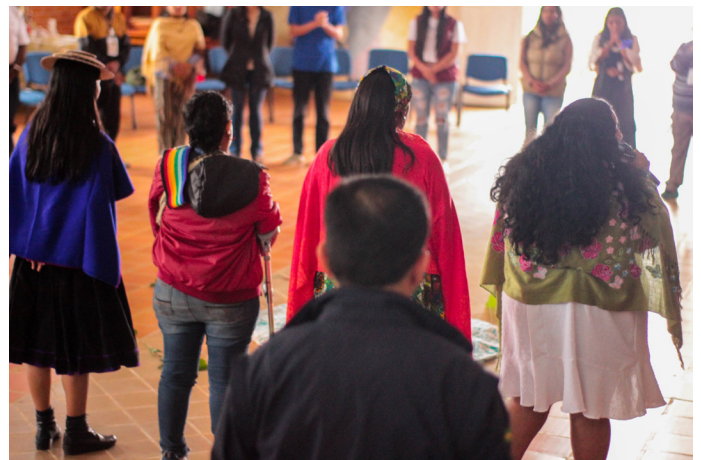
Photo: The Institute Foundation for the Construction of Peace (FICONPAZ), CONPAZ Cauca Departmental Meeting, 2022.

There have been many attempts to end the violence while simultaneously providing socio-economic support structures to the local community. In 2016, the government signed a peace agreement with the largest remaining guerrilla group, Fuerzas Armadas Revolucionarias Colombianas (FARC). In 2022, negotiations began between the government and Ejército de Liberación Nacional (ELN). Despite the progress of hosting formal negotiations, there were 21 massacres which claimed the lives of 67 people in the first two months of 2023. 7 Illegal armed groups continue to target human rights defenders and social leaders, especially against Afro-Colombian and indigenous communities defending their ancestral territories. Several of the WFBMs interviewed have been targeted or know others killed in the ongoing violence. 8