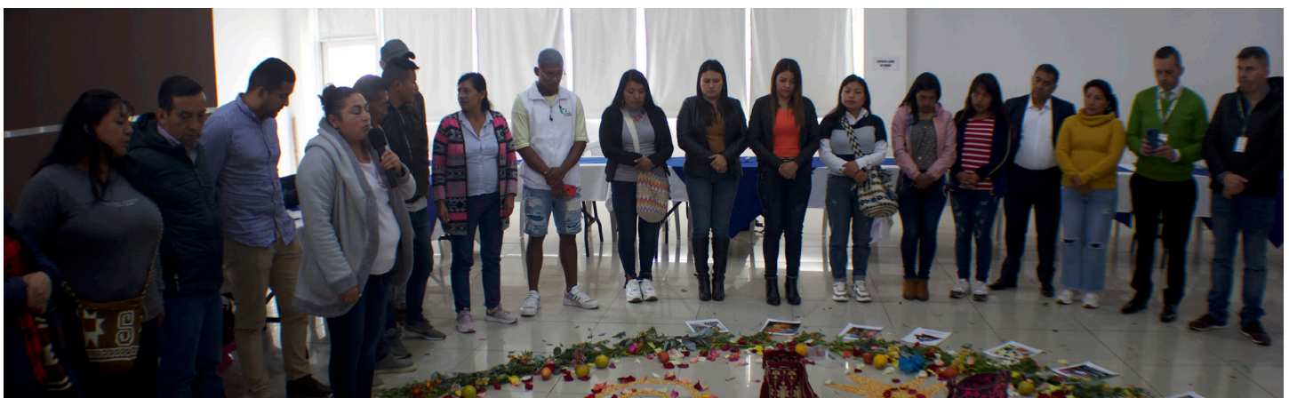
CONPAZ Narino Departmental Meeting, 2022 Departamental Nariño, 2023

Colombians view cultural symbolism and respect for religious authority as elements in which shape collective identity. When mediation efforts, and mediators themselves embrace religious or spiritual symbolism through a religious or spiritual lens, it is well received by mediating parties. Often, this connotation 'garners respect' and women of faith are viewed as 'deserving respect.' 40 A common reverence for faith and spirituality is especially relevant in rural areas of Colombia. Accordingly, faith has provided opportunities to access particularly hard-to-reach communities, specifically those in rural areas. 41 In many parts of Colombia, armed actors have only permitted churches or religious organizations to work on the ground, with the Catholic church having historically more influence than other denominations, especially in political negotiations. Being from faith-based backgrounds also allows women mediators to engage in advocacy as well as mediation, as they are perceived as apolitical, a critical element, especially when politics is a source of conflict.