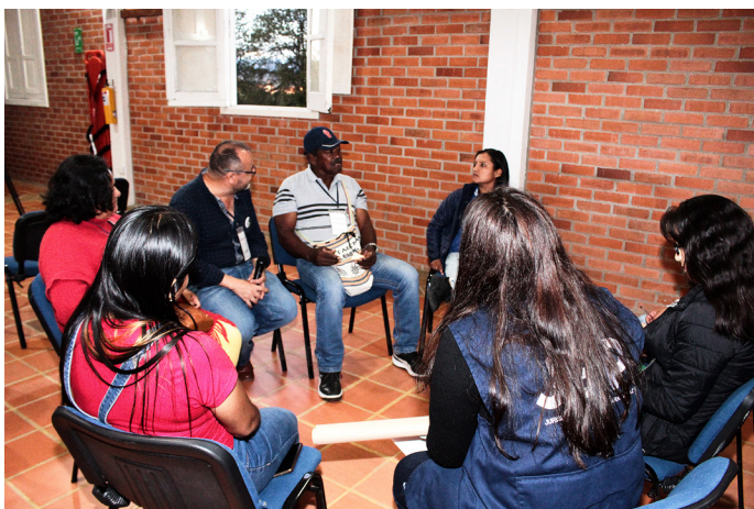
Photo: The Institute Foundation for the Construction of Peace (FICONPAZ), CONPAZ Cauca Departmental Meeting, 2022.

The main challenge impeding the successful engagement of WFBM in the mediation space is connected to elements of discrimination and gender inequality. This encompasses discrimination by key actors or parties with whom they are trying to mediate with as well as prejudice within religious institutions or faith-based communities. These areas of discrimination stem from persistent gender inequality throughout Colombia and the patriarchal stereotypes in which circulates in the country's collective consciousness. In some settings, WFBM are invited to participate only if they operate under male leadership. 25 That means a woman's intervention is seen to be more acceptable if they act as part of a team led by a man, thus limiting their independence and ability for equal participation.