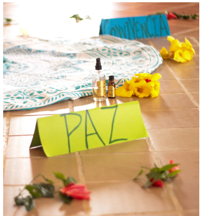
CONPAZ Cauca Departmental Meeting, 2022.

One of the cultural stereotypes that provides a unique entry point for WFBMs is the association of women with motherhood and motherly attributes, such as being caring and gentle. Many WFBMs believe that being seen as 'motherly' makes them less intimidating compared to their male counterparts, particularly in the eyes of men in the armed groups. This perception has enabled them to enter into spaces predominantly occupied by male actors by establishing close relationships and receiving confidential information and 'confessions,' in their role as mother figures. In the instances of Caquetá and Chocó, WFBMs have negotiated with groups for the release of children forcibly recruited, leveraging their trust they have built with the group in their role as mother figures.