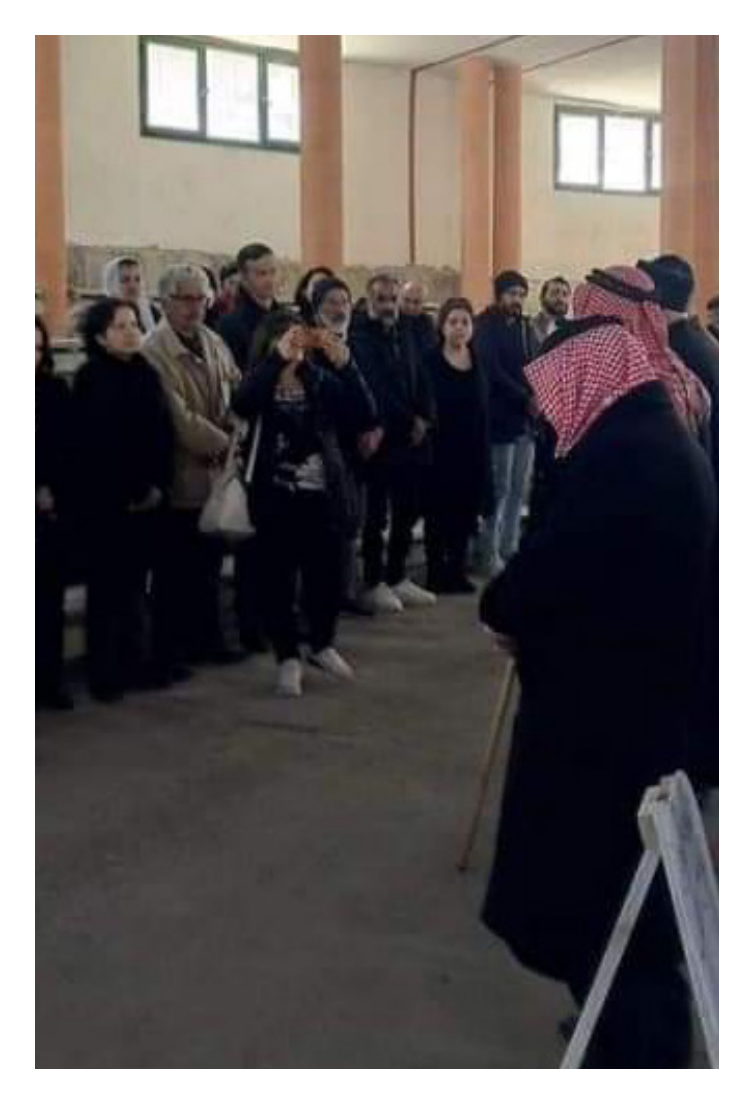
Photo: A condolence vigil from the Druz community for the earthquake victims in Al Suwyida City, Syria Southern region.

This case study examines the experiences of women faith-based mediators (WFBMs)¹ in Syria, including the opportunities and the challenges they face, as well as support needs to strengthen their engagement in the field. Historically,² Syrian women have been underrepresented in government and political decision-making processes. Yet, women have played a key role in major political and social movements, including in the Syrian Revolution, beginning in 2011³ through participating in uprisings and advocating for national political change.