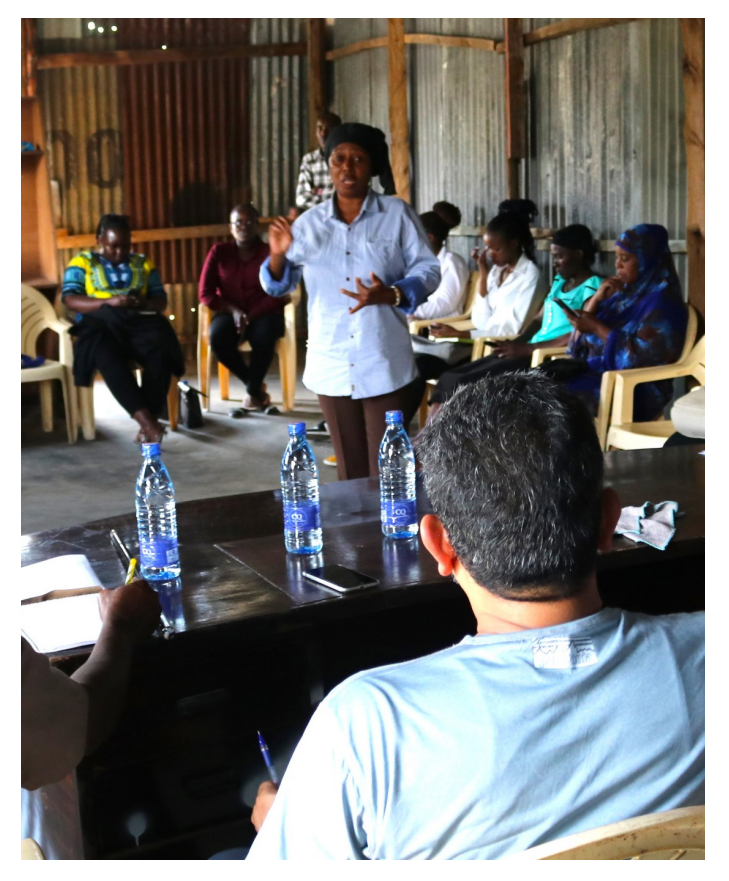
Photo: Members of the Embakasi Women of Faith Network during an anti-sexual gender-based violence experience sharing workshop.

Kenyan society is faced with a myriad of challenges, especially on matters of peace, development, and cohesion. As a result, there is a dire need for different actors to contribute towards a society that is less violently motivated. Women faith-based mediators are actively on the frontline advocating for a just, peaceful, equitable, and inclusive society on all fronts. The use of faith as the armour in this battle is a source of motivation.35 They have leveraged their faith identity to engage communities and have forged alliances with other institutions to shape and engage in mediation. They are influential because of their faith identity and due to the trust that they have earned due to active participation in community matters. However, the efforts and potential of WFBMs are yet to be fully recognized.